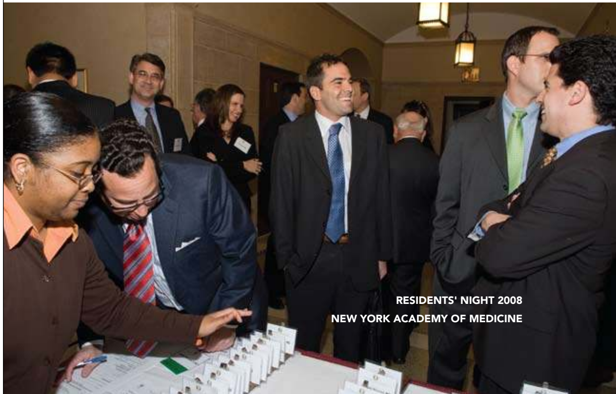
RESIDENTS' NIGHT 2008 NEW YORK ACADEMY OF MEDICINE