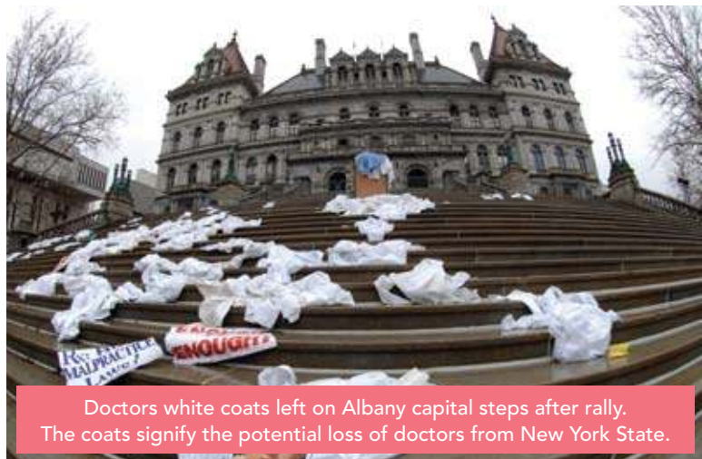
Doctors white coats left on Albany capital steps after rally. The coats signify the potential loss of doctors from New York State.