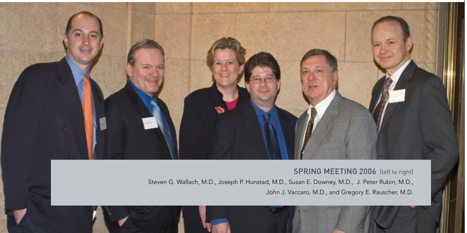
SPRING MEETING 2006 (left to right)